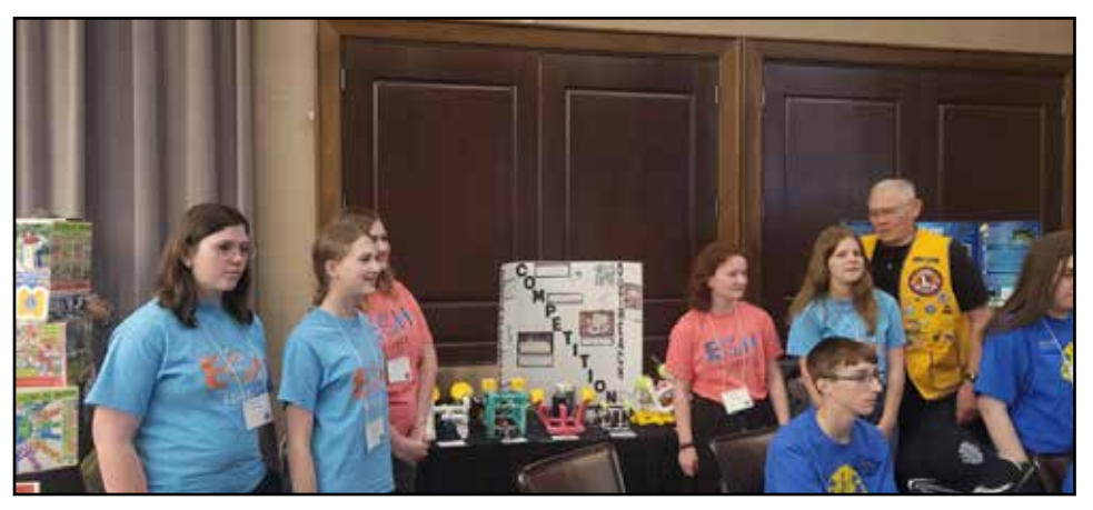
The team next to their booth at the MD-19 Conference. (Also shown are the team's 5 R.O.Vs)