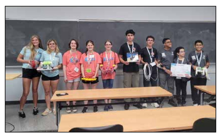
During the 2023 International SeaPerch Competition, the team met people from around the world. Shown is ECH with teams from South Carolina, California, and Egypt.