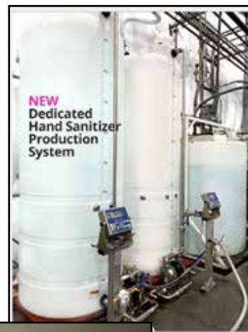
Hand sanitizer in production