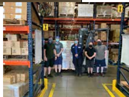
Warehouse crew shipping product to King County