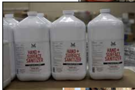
Gallon size hand sanitizer