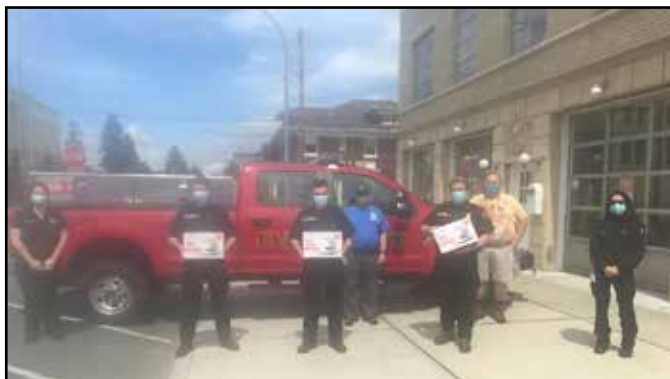
The three white boxes are the 3M Lumin machines used to sanitize face masks to be reused again.