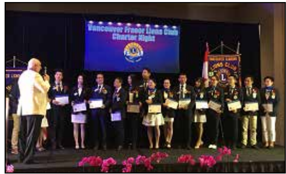
2019 19-A Vancouver Fraser Charter Night Celebration