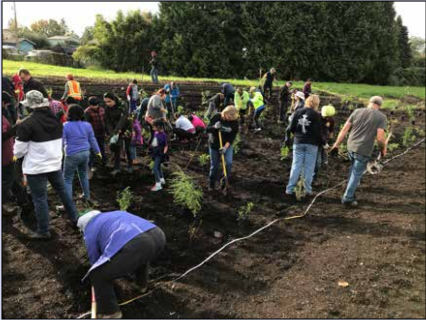
Volunteers busy digging and planting

This final Interurban link is expected to be completed in 2024 and we look forward to seeing people biking and hiking along the trail.