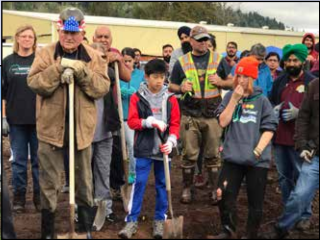
When all said and done, these volunteers may be tired, but very proud of their hard work and the camaraderie of working together with like-minded folks.